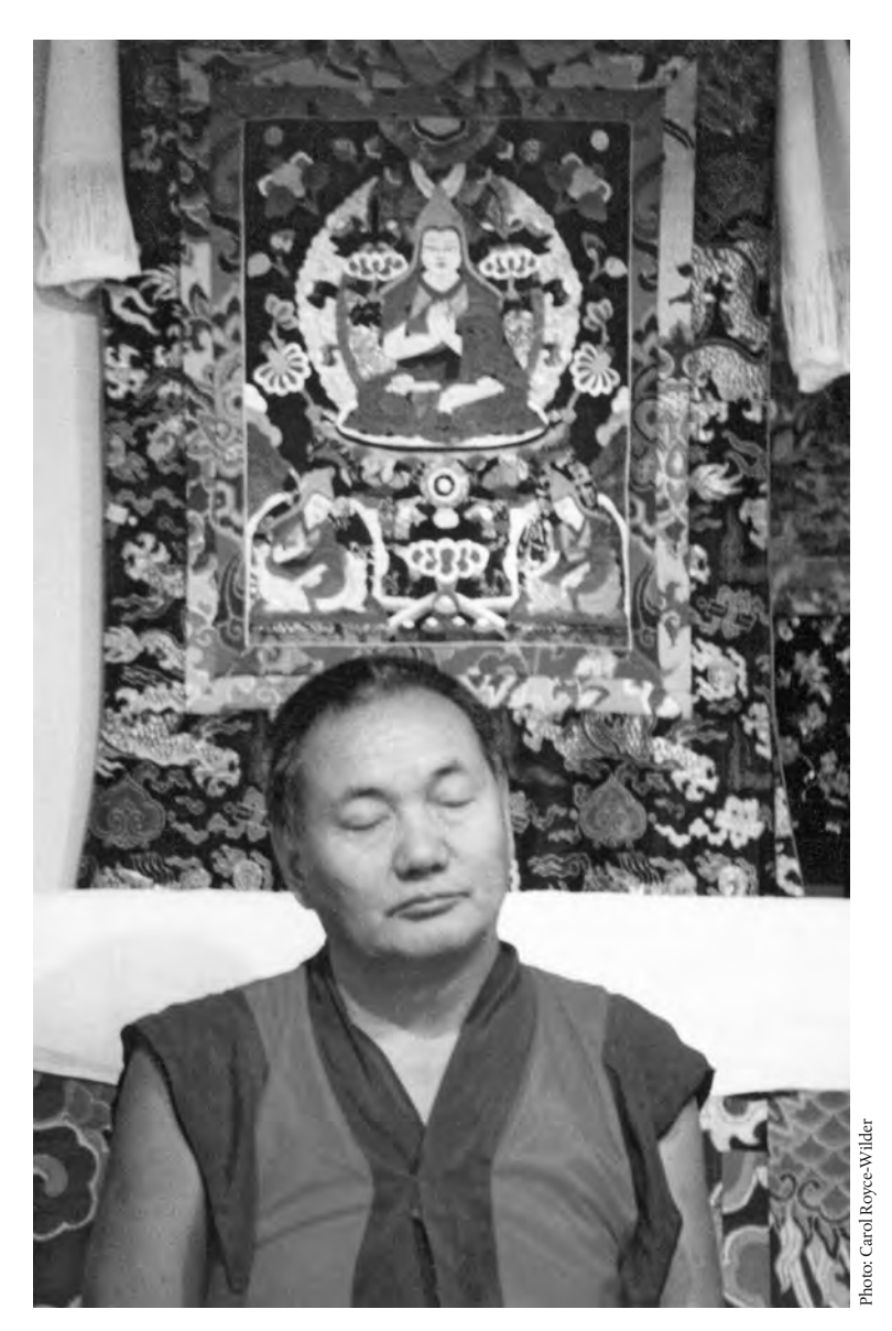
Vajrapani Institute, July 1983